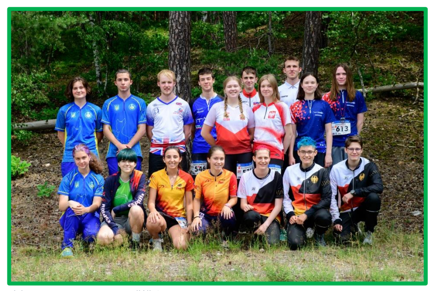
(c) WTOC 2023 – Dan Dvořáček